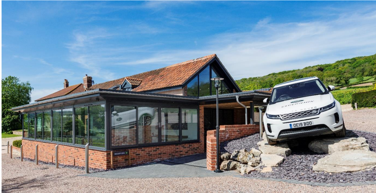
Pictured: Land Rover Experience's brand-new training and conference room