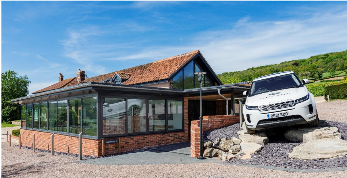
Pictured: Land Rover Experience's brand-new training and conference room